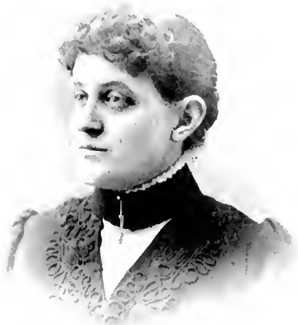
CARRIE LANE CHAPMAN CATT.